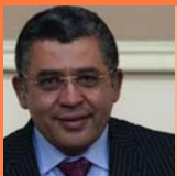
Khaled El Fekky